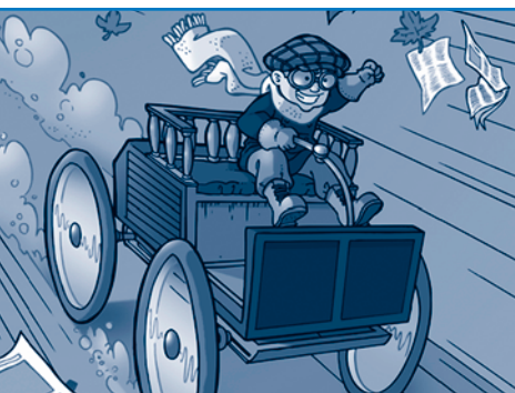
Illustration : Benoît Godbout